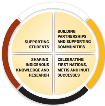
PATHWAYS TO INDIGENOUS ACHIEVEMENT

Come learn about the growing number of opportunities and resources available at the U of M. We can't wait to meet you!