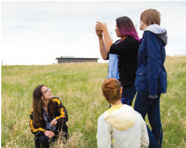
Graduate student volunteers work with high school students from across the country at the Verna J. Kirkness Science and Engineering Education Program.

If you are at least 21 years of age, have faced barriers to university education, have social service experience, reside in the city of Winnipeg and love working with people, consider this highly successful Access program. Located in the heart of Winnipeg’s North End, ICSWP offers you: