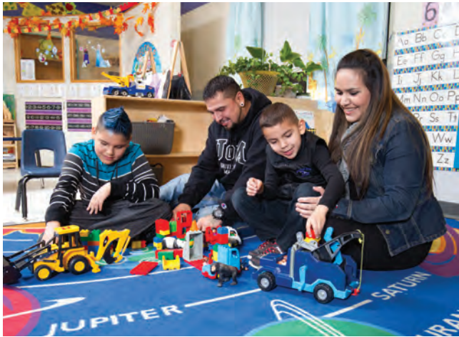
The U of M offers on-site daycare.