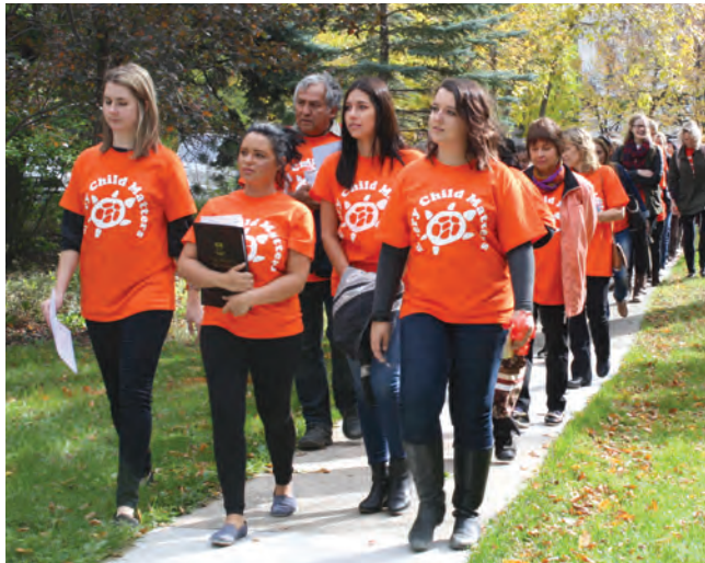
College of Nursing students and staff walk for Every Child Matters–Orange Shirt Day.

The Engineering Access Program at the U of M, the most successful program of its kind in Canada, offers: