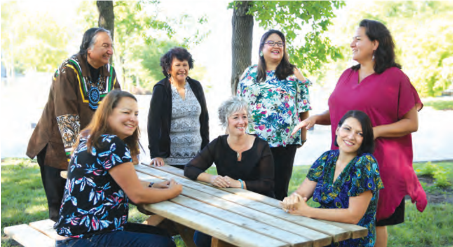
Indigenous Student Centre staff