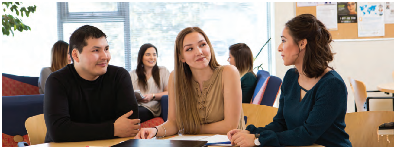
The Qualico Bridge to Success Program eases the transition from high school to university.

At the Indigenous Student Centre (ISC), you’ll find a caring, supportive environment and staff who are eager to share their knowledge and guidance.