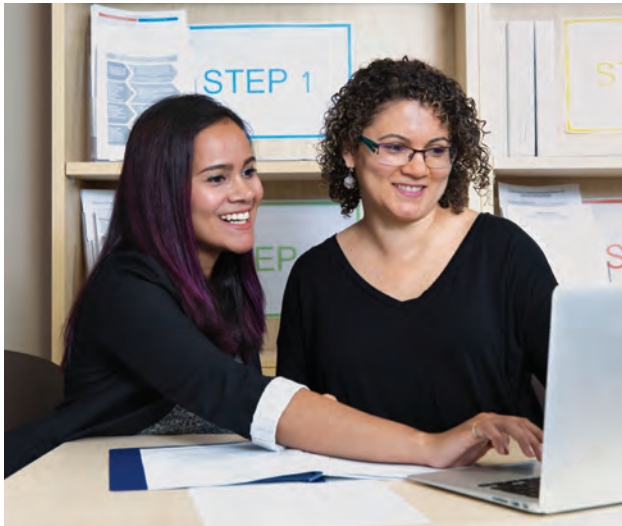
Career Services staff can help connect you with opportunities that will prepare you for career success.