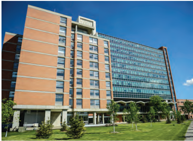
Pembina Hall Residence has 358 private rooms, each with its own washroom.