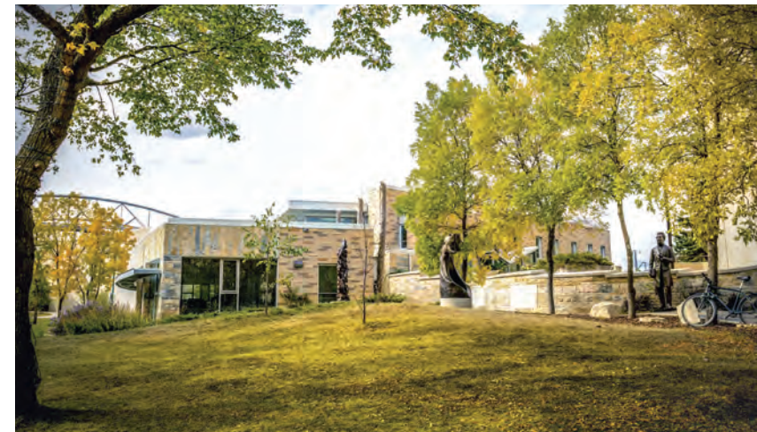
Migizii Agamik—Bald Eagle Lodge