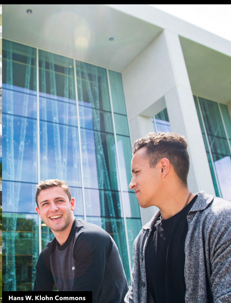
Hans W. Klohn Commons