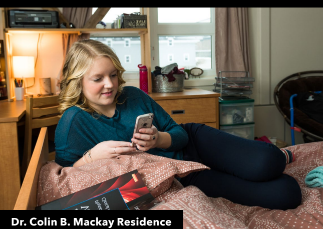
Dr. Colin B. Mackay Residence