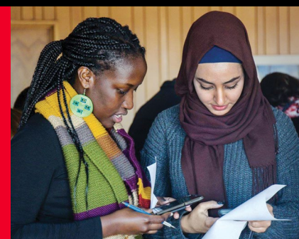
International Students' Society

The Promise Partnership is a community outreach literacy initiative with a local elementary school