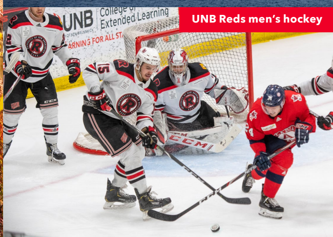
UNB Reds men's hockey