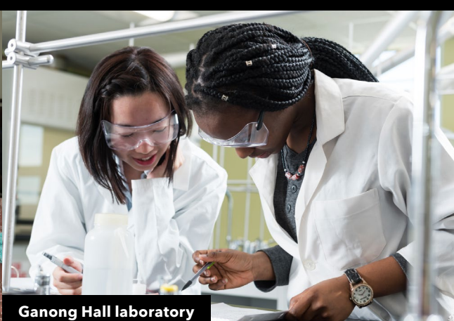
Ganong Hall laboratory