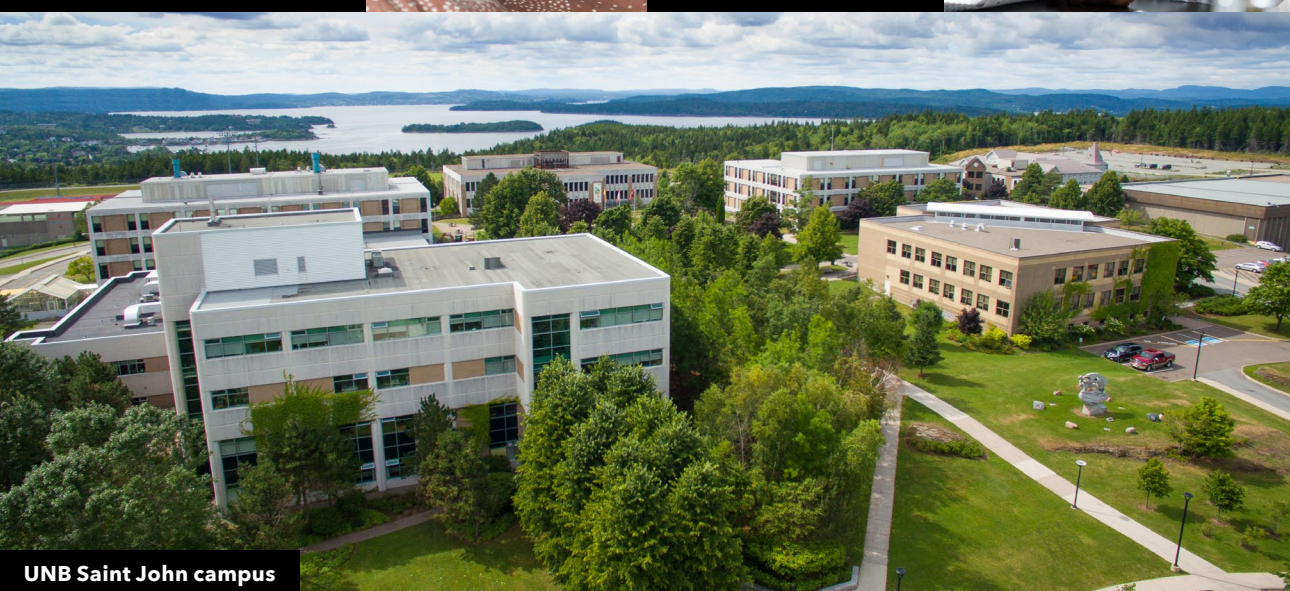
UNB Saint John campus