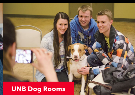
UNB Dog Rooms